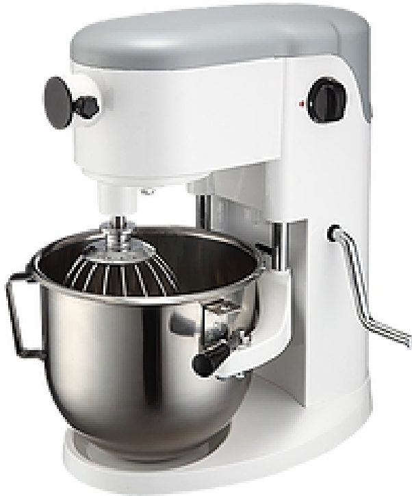
TABLE TOP PLANETARY MIXER SP-502B